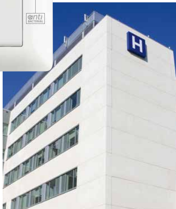
ANTIBACTERIAL TECHNO- POLYMER COVER PLATE - ANTIBACTERIAL DEVICES