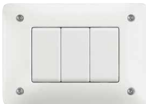
PAINTED ANTI-REMOVAL ZAMAK COVER PLATE

These cover plates are supplied with appropriate support, to which they are fastened using 4 TORX cut screw. The assembly creates an anti-tamper light point, recommended in non supervised areas open to the public.